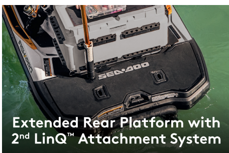
Extended Rear Platform with 2 nd LinQ™ Attachment System

A spacious, quick-attach fishing cooler designed for easy access and equipped with numerous convenient features.