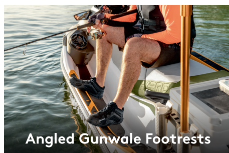
Angled Gunwale Footrests

Adds 11.5 inches to the back of the watercraft to increase stability, space, and storage capability.