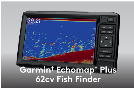
Garmin † Echomap † Plus 62cv Fish Finder

A top-of-the-line navigation, charting and fish-finding system using CHIRP technology for high definition images.