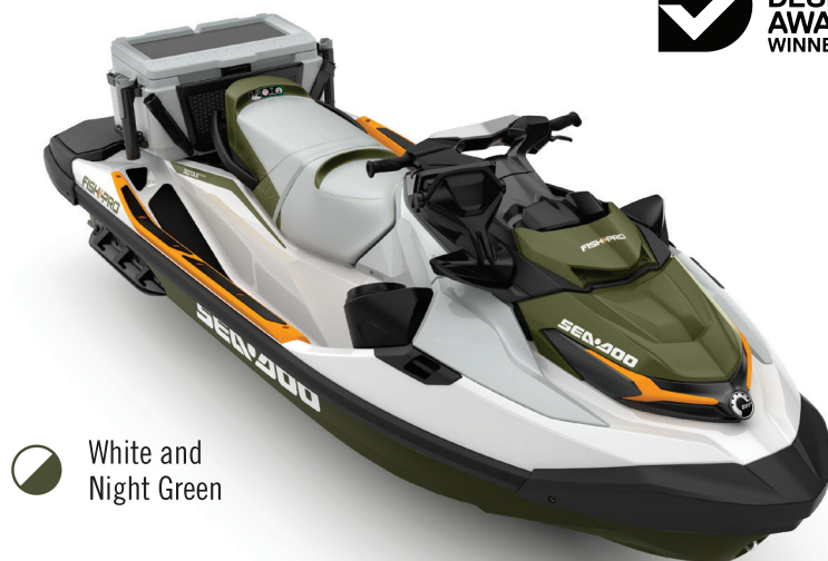
White and Night Green